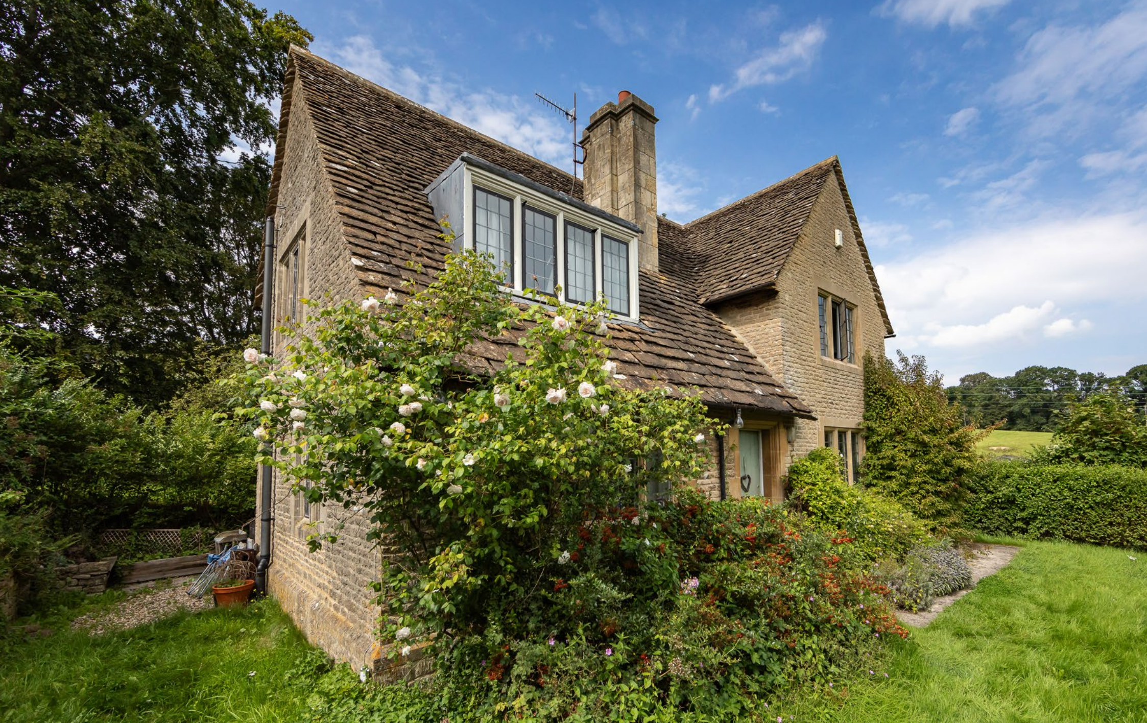
THE COTTAGE Lower Shockerwick