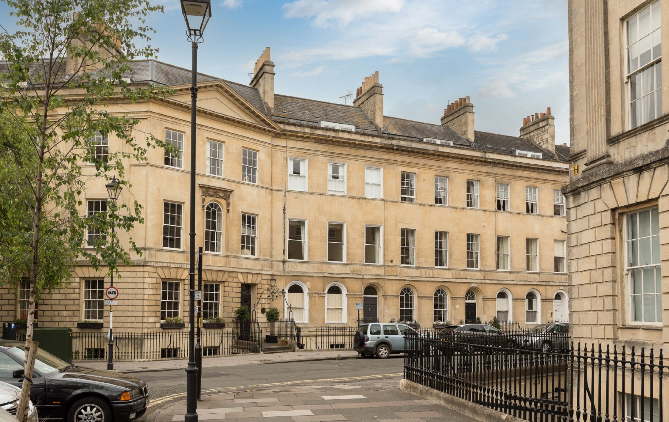
2 HENRIETTA STREET Bath