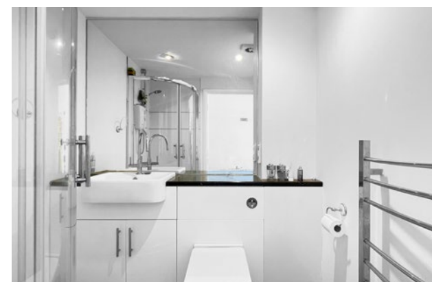
FLAT 5, 21A UNION ROAD Cambridge