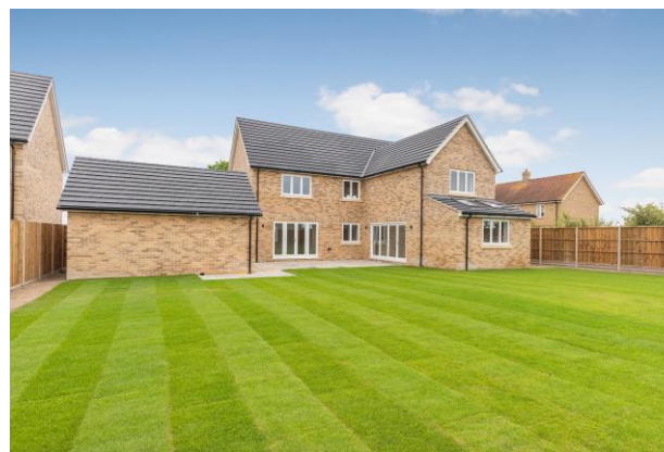
Classification LZ - Business Data