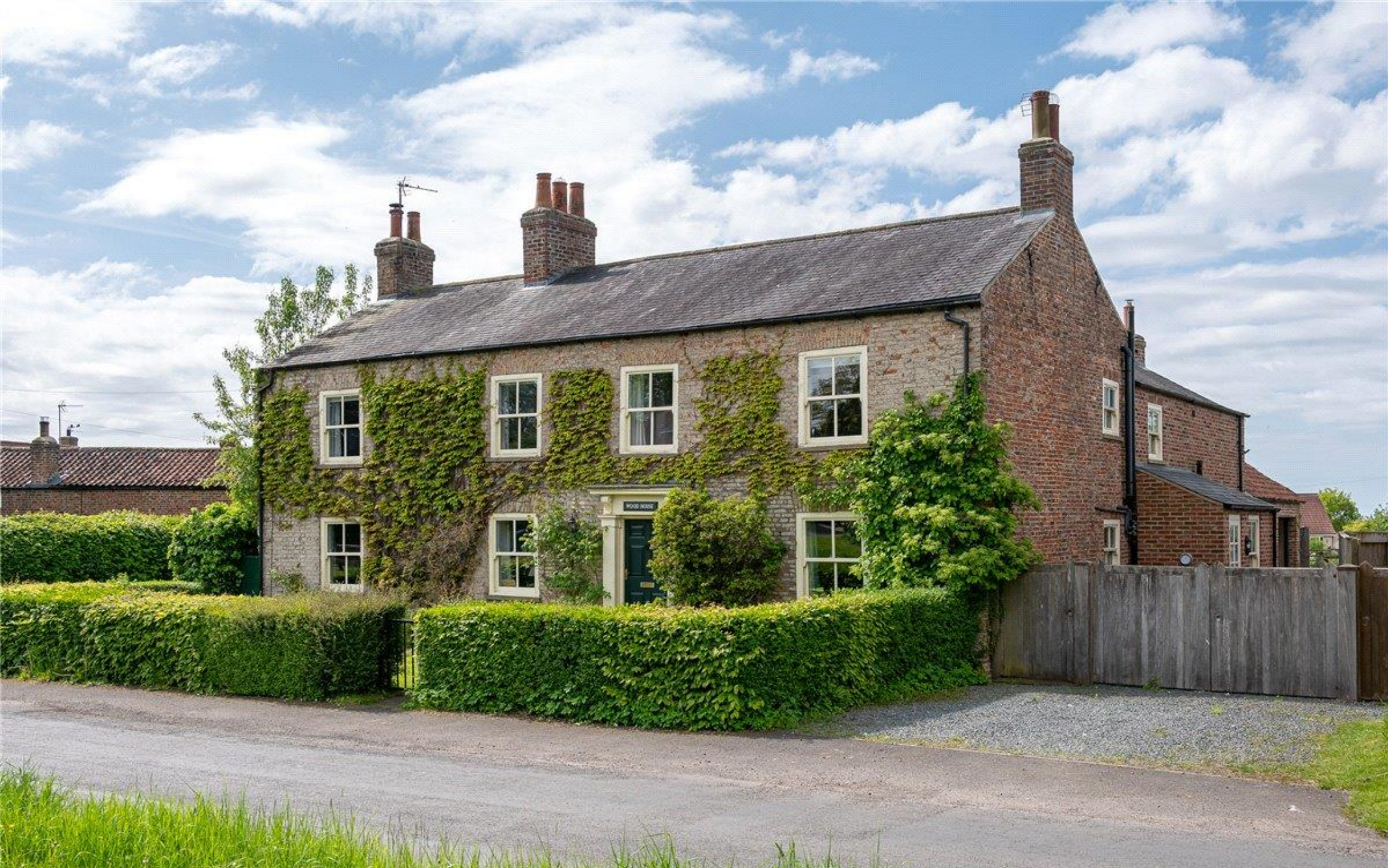
WOOD HOUSE, HIGH STREET, THORNTON LE CLAY £985,000