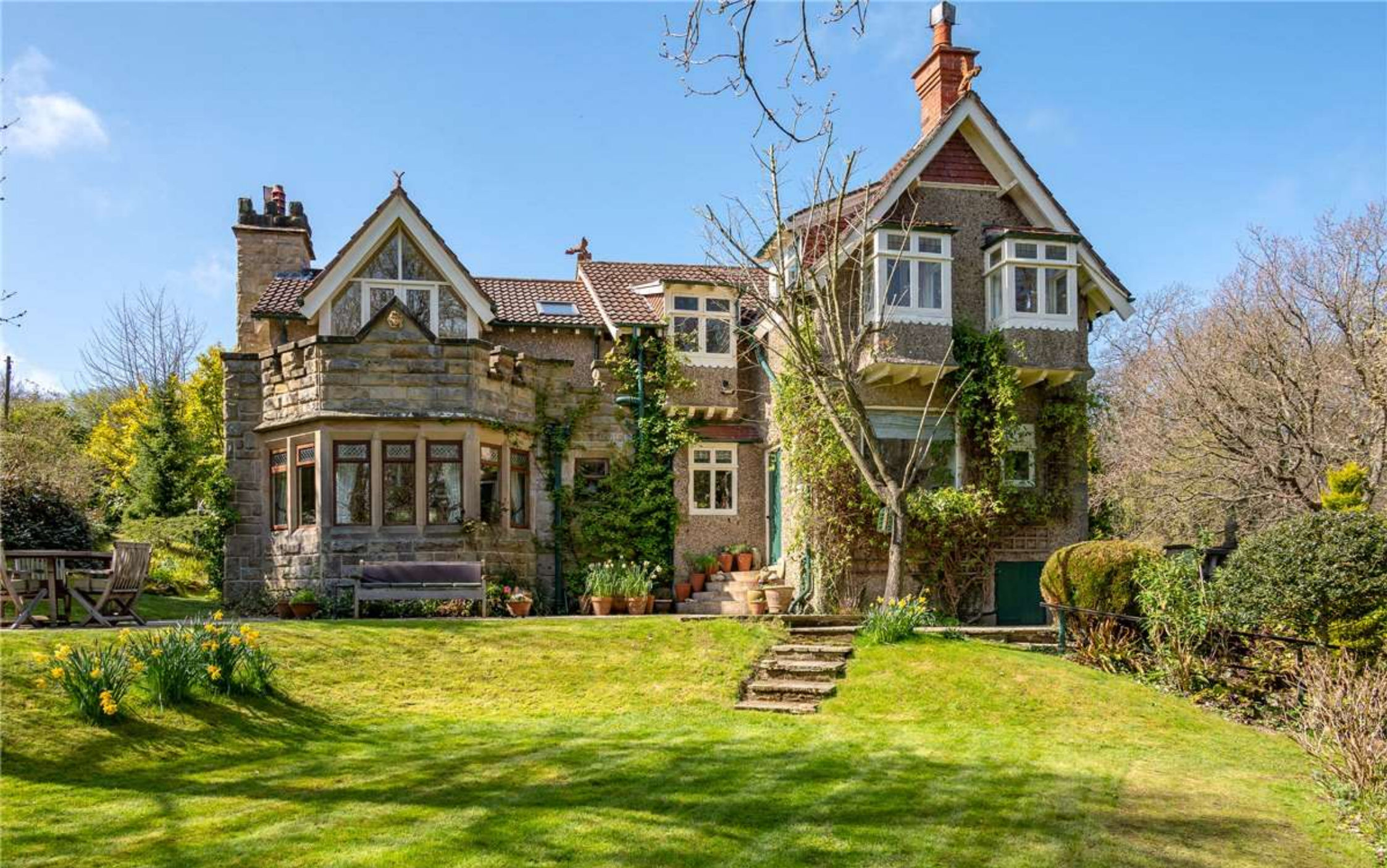
WYKE LODGE, STAINTONDALE ROAD, CLOUGHTON GUIDE PRICE £795,000