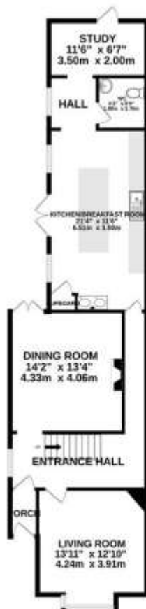
GROUND FLOOR 360 sq.ft. (33.0 sq.m.) approx.