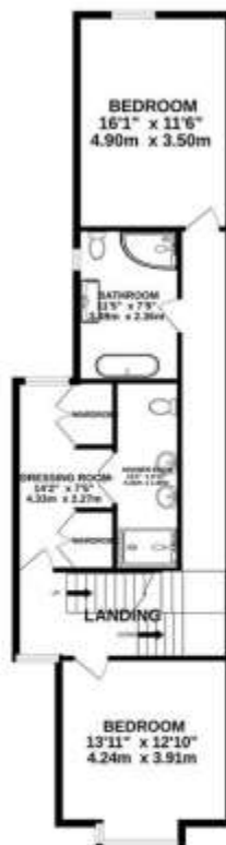
1ST FLOOR 318 sq.ft. (29.5 sq.m.) approx.