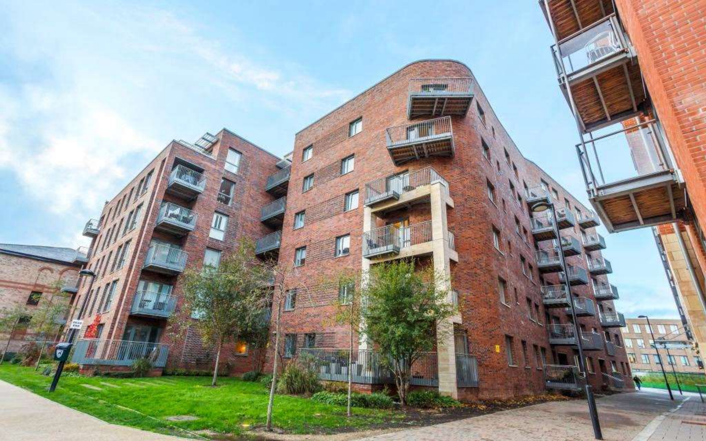
54 BELLERBY COURT, YORK Guide Price £450,000