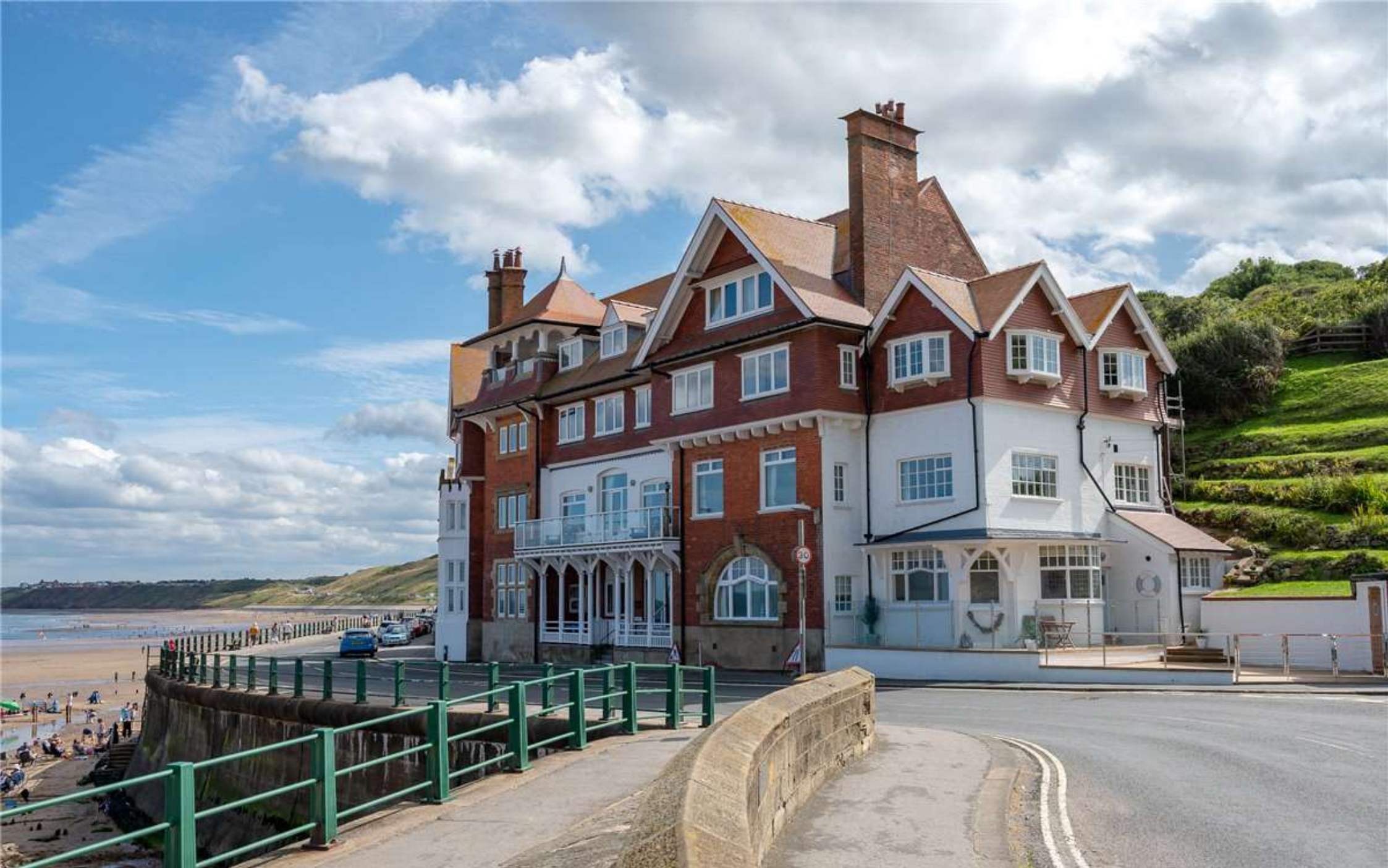
9 SANDSEND COURT, THE PARADE, SANDSEND, WHITBY Guide Price £550,000